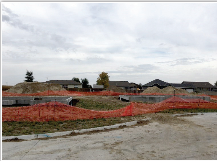
Work is in progress on six spec homes being built on the new Avenue J cul-de-sac, as well as two others on 25th Street and 26th Street. Contractors hope for a spring completion.

If you have passed by the northeast part of town in recent weeks, you've likely seen a lot of activity in home construction. Most of the work is a direct result of the vision of the GIC housing committee, the Community Redevelopment Authority (CRA) and other community leaders wanting to continue to grow Gothenburg.